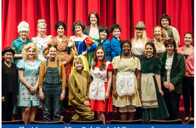
The Adventures of Rose Red: Grade 12 Drama performance

The graduating class of 2014. Congratulations Grads